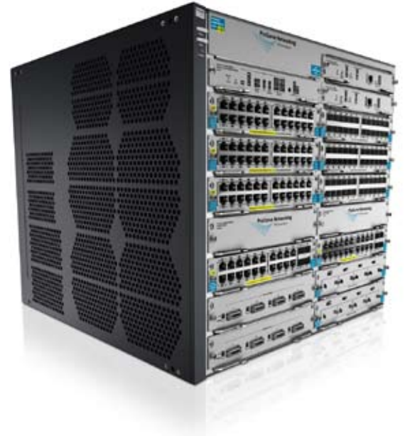
Award-winning HP ProCurve Switch 8212zl