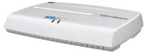
HP ProCurve Radio Port 210

In 2005 Kennedys originally deployed an HP ProCurve network solution across its three City of London sites to improve service availability and business continuity. Although this highly resilient solution satisfied the firm's networking requirements for some considerable time, Kennedys recently reviewed its needs following substantial business growth.