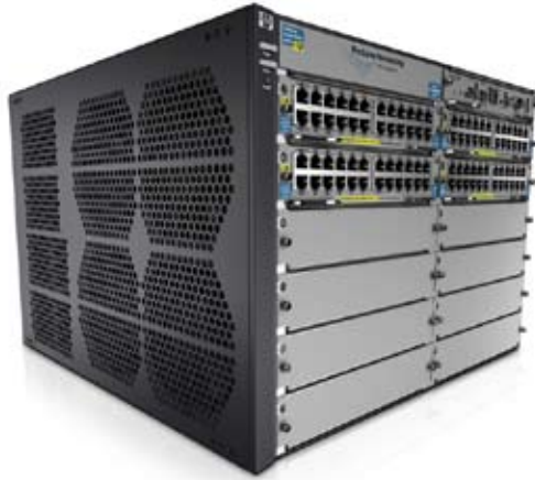
HP ProCurve Switch 5412zl